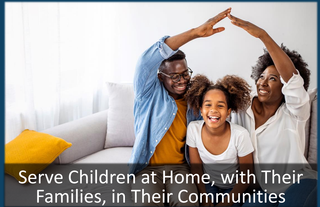
Serve Children at Home, with Their Families, in Their Communities