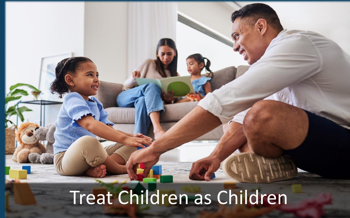
Treat Children as Children