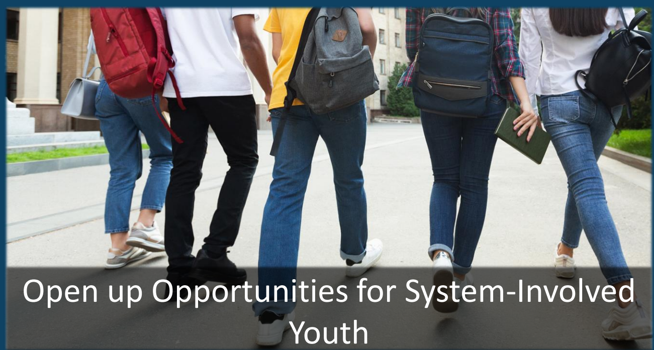
Open up Opportunities for System-Involved Youth